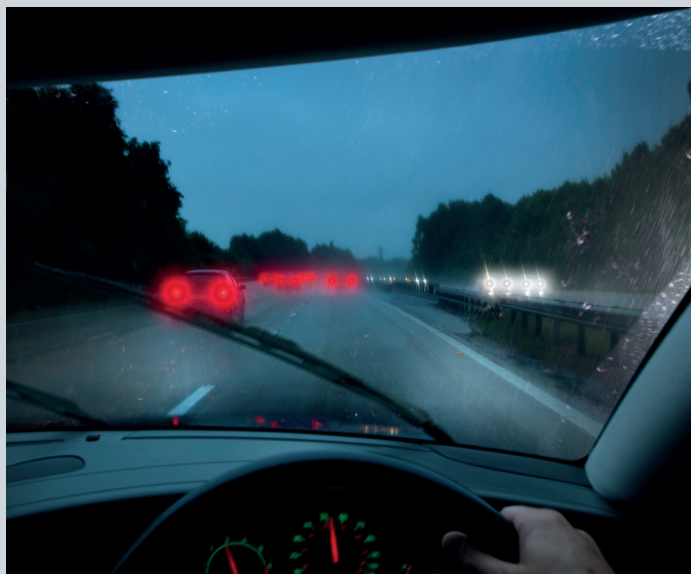
Some advanced IOLs

With some advanced IOLs, it can be normal to experience visual disturbances such as halos and glare around lights at nighttime. These visual disturbances typically reduce over time, however, the RayOne Galaxy's patented optic is specifically designed to significantly reduce those visual disturbances from the outset*.