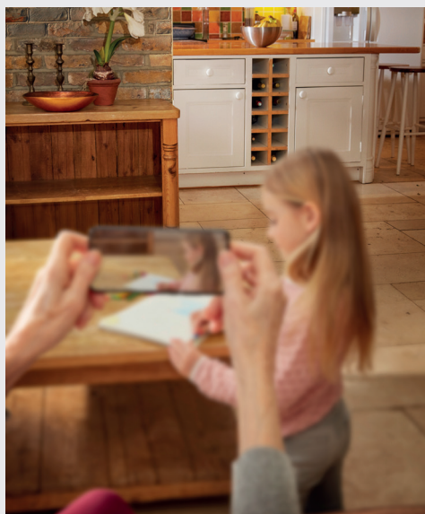
After surgery with a standard monofocal IOL†

With less expected visual side effects than many other advanced IOLs, the RayOne Galaxy is possibly the most technologically advanced IOL available today.